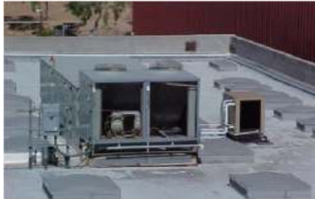
Unit #1 Trane 20 Ton Capacity

EER Max ™ Pat. Nos.: 6,070,423; 6,857,285; 7,150,160